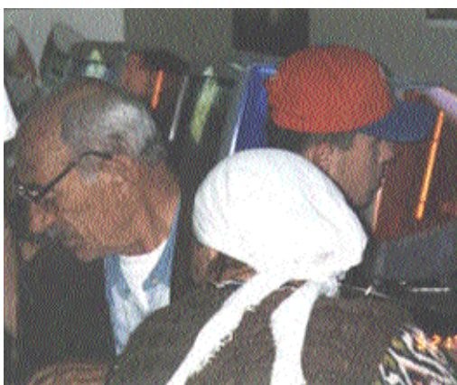
Closeup of above.