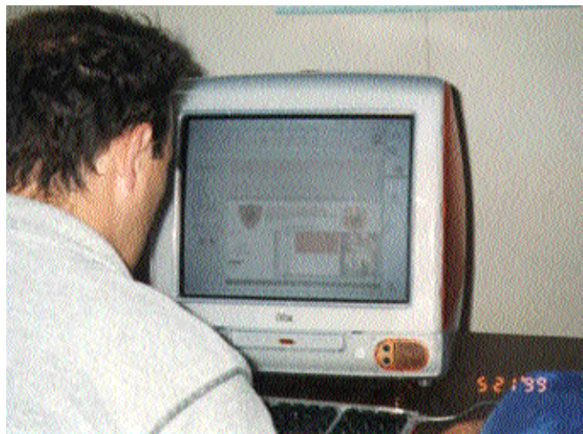
With very little previous computer experience, this man was able to use the iMac and Internet. The games were a popular respite, as well.