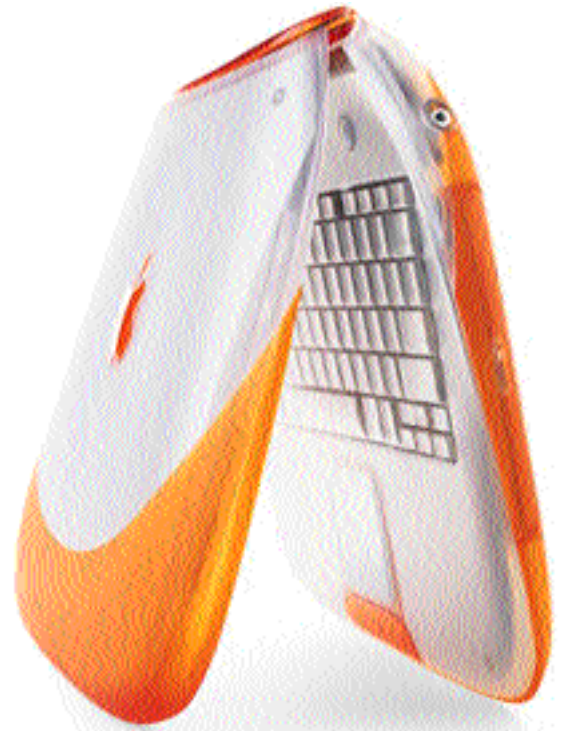
The iBook—pretty l'il thing . . . check out the AirPort on page 8.

The iBook offers a very affordable option that gets you around this obstacle. It's called AirPort, and it lets you use your iBook from your couch, or anywhere else you make yourself comfortable—up to 150 feet from an easy-to-install AirPort hardware access point. Because you don't have all your fun sitting down in one place. You shouldn't have to do all your computing sitting down in one place, either.