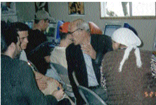
Couple being interviewed by the Washington Post. They had come to the RIAI trailer in hopes of locating some of their ten children via the internet.