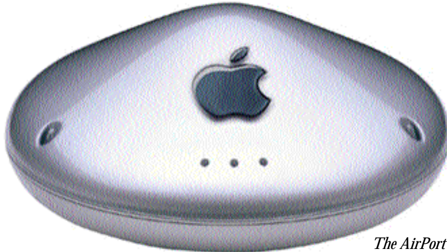
The AirPort hub.

A pple teamed with Lucent Technologies., a leader in wireless networking, to design and deliver AirPort. The 18 month-long collaboration has resulted in the most cost-effective