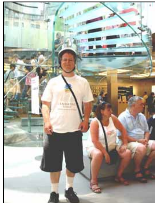
Your friendly MUGShots editor standing in Apple's new 5 th Ave. store in Manhattan.